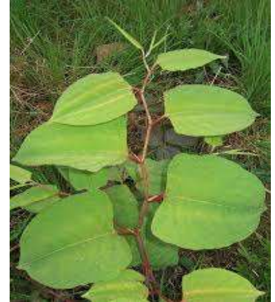
Beautiful red graceful stems

The Colchester Garden Club has started a multi-year conservation project to cut two large stands of Japanese Knotweed at the 206+ acre open space park, Ruby and Elizabeth Cohen Woodlands; waterways from this part flow into two area watershed. This project is in partnership with the Colchester Public Works Department, and the club will reach out to request other community groups and volunteers get involved.