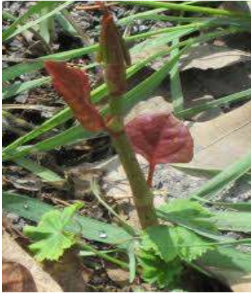
Lovely red new growth